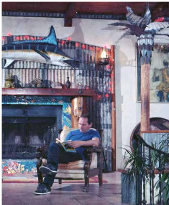
The author at Topanga Canyon, 2016